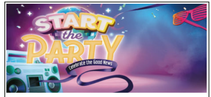
REGISTRATION FOR VACATION BIBLE SCHOOL 2024 IS NOW OPEN!

Contact Terri Brubaker for more info: Page 8 <u>terri@chooseablessing.org</u> or 775-253-5552